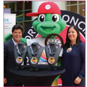
Unifor sponsors medal ceremonies and cultural festivals at the Toronto 2017 North American Indigenous Games

The Games will host more than 5,000 participants, 2,000 volunteers and thousands of spectators, in what is expected to be the largest sporting and cultural