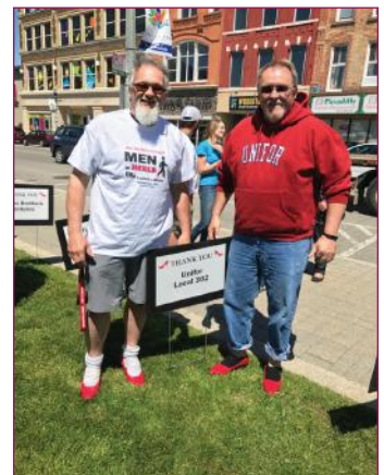
Local 302 members walk to help end domestic violence

If your local is involved in a community initiative or program tell us about it! Email communications@unifor.org to share the news.