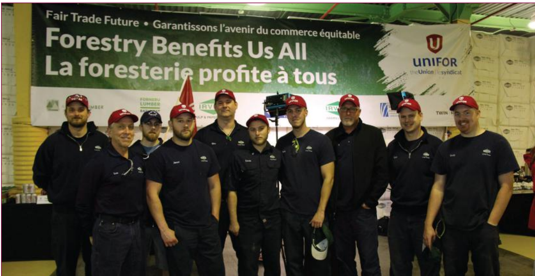
Over 1,000 members team up with Irving Pulp & Paper in New Brunswick to call for a fair softwood deal